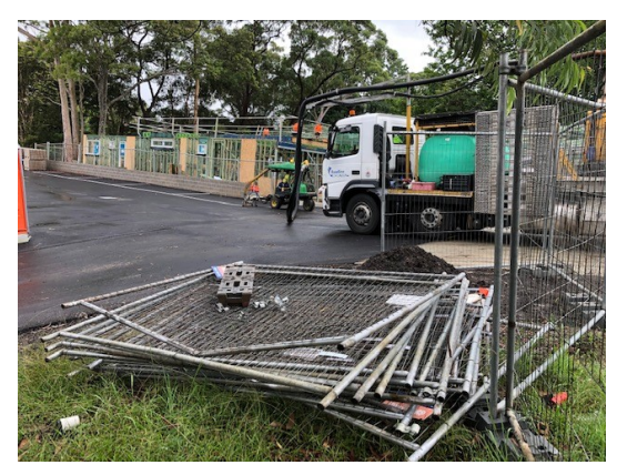
Despite this week's wretched weather the second Group Home house (the one nearer to the church) has also begun to rise from the ground.